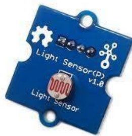
Figure 5- light sensor

Photo-junction Devices – These photo-devices are mainly true semiconductor devices such as the photodiode or phototransistor which use light to control the flow of electrons and holes across their PN-junction. Photo-junction devices are specifically designed for detector application and light penetration with their spectral response tuned the wavelength of incident light.