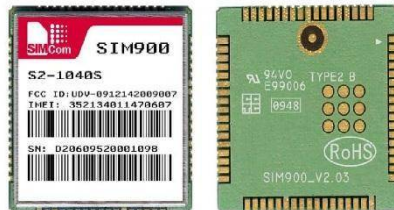
Figure 4 - SIM900 pin diagram